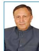
Shri Shekhar Dutt Former - Governor Chhattisgarh, India